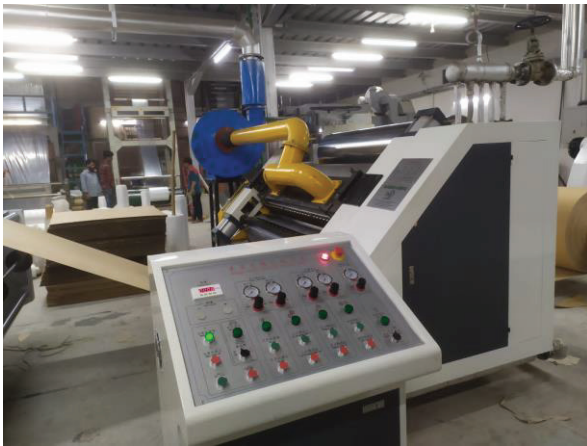
Figure 1: Corrugation Machine (Part-1)