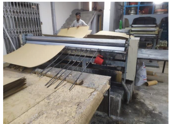
Figure 4: Pasting Machine