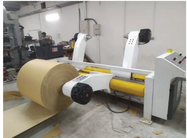
Figure 2: Corrugation Machine (Part-2)