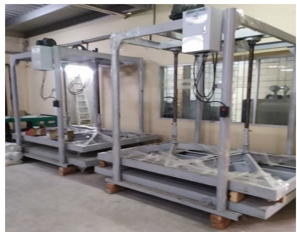
Figure 6: Pressure Machine