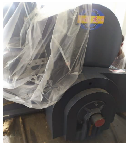
Figure 10: Die-Cutting Machine