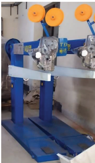
Figure 9: Stitching Machine