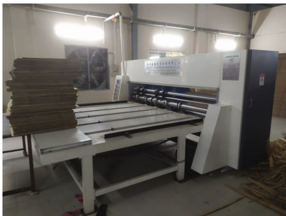
Figure 3: Sheet Cutting