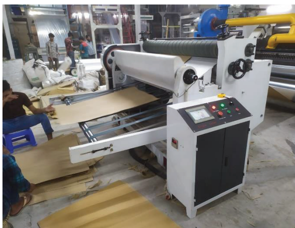
Figure 5: Corrugated Cutting Machine