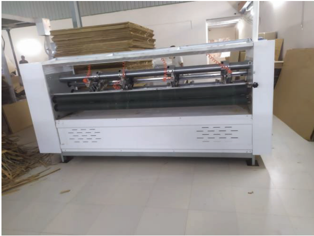
Figure 7: Creasing Machine: